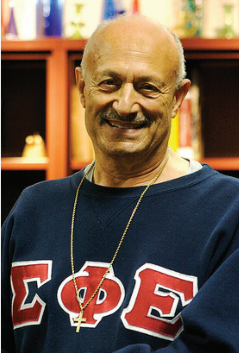
Cover, LMU Journal for alumni and friends